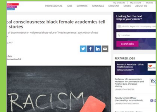
Press: Times Higher