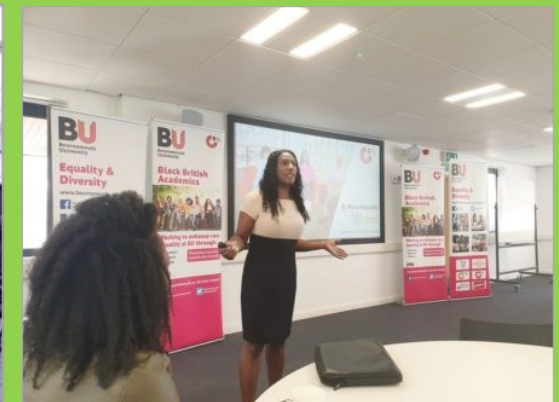
Equity & Diversity Leadership