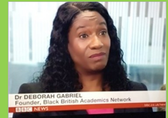
TV: BBC News