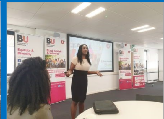
Equity & Diversity Leadership